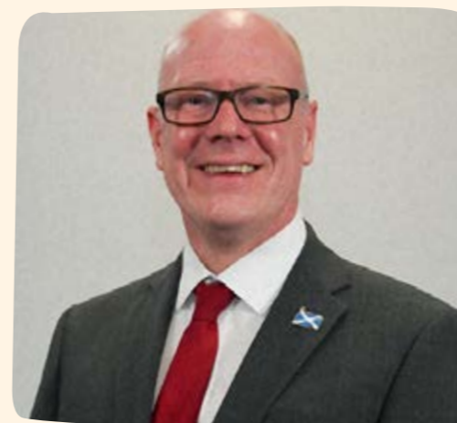
Kevin Stewart MSP

funding empowers recipients to be employers, to exercise choice and control, and to be productive members of society and live a good life regardless of their impairment.