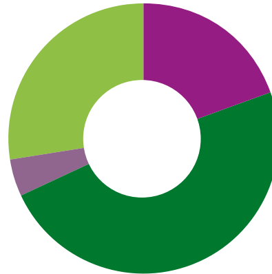
Full & Part Time M/F